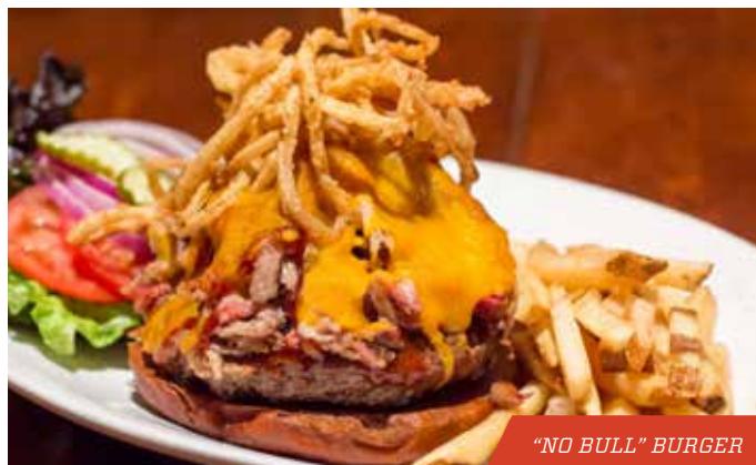
“NO BULL” BURGER

Slow-cooked pulled pork smothered in our savory Cadillac sauce, topped with onion straws and served with a side of coleslaw. 11.79