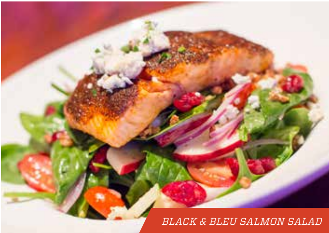
BLACK & BLEU SALMON SALAD