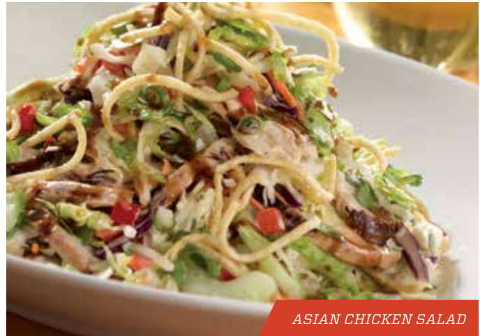
ASIAN CHICKEN SALAD