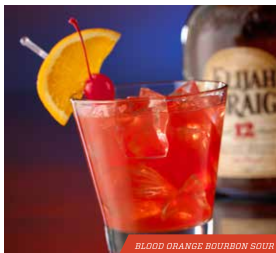
BLOOD ORANGE BOURBON SOUR

Smashed fresh raspberries, blackberries and blueberries, with Jack Daniel's Whiskey, Chambord Black Raspberry Liqueur, a touch of simple syrup and sweet and sour. 8.50